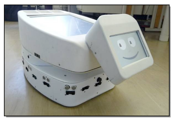
Fig. 1. The IROMEC robot in the horizontal configuration (early prototype version).

The IROMEC robot [36] has two different configuration possibilities: horizontal and vertical. In the horizontal configuration (see fig. 1) the interaction module is attached to the mobile platform in order to support a complete set of activities requiring a wider mobility and dynamism of the robot. In the vertical configuration the interaction module is connected to a dedicated docking station to provide both stability and recharging. Additionally, the robot has several interfaces such as dynamic screens for input and output, buttons and wireless switches. In order to satisfy the needs of children with autism, the robot is also equipped with a simple mask to cover the small face screen.